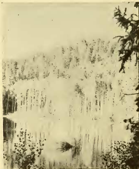
Figure 11. Posy Lake, Aquarius Plateau, elevation 9,250 feet. A stand of aspens in the background. (By permission of Utah Magazine.)

LOCALITIES: Specimens of this species were collected at Posy Lake, Steep Creek Lakes and in a small pond south of the Table Cliff Pass, at elevations from 8,500 to 9,500 feet. Collections were